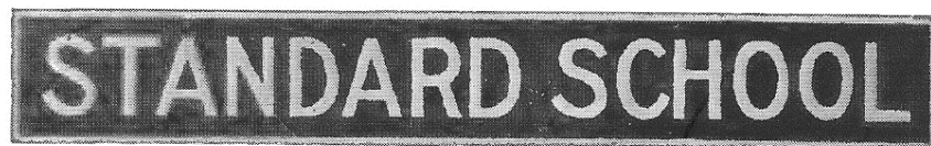
Figure 2: Illinois standard school plate for an elementary school, 1920.

Blair made it clear that many districts had made sincere efforts to bring their schools up to standard, and he held out the hope that one day they too would be able to hang the 4' by 24" plate (Figure 2) above their front doors: “For every school standardized at least three have made substantial improvements along the lines suggested,” he wrote. “Some have repaired the school-house, have painted the outside, decorated the interior. . . .” 60