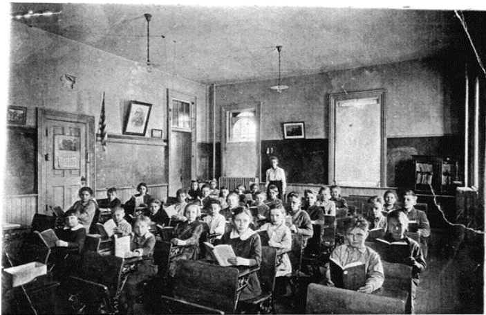
Figure 4: Huntley Consolidated School, ca. 1920; courtesy of the McHenry County Historical Society.

Superintendent Blair also used his 1920 report to again promote school consolidation as a path to school improvement. In fact, approximately 20 percent of the report was used to advance the subject. The thrust was to explain the process (i.e., how school districts and communities could effect mergers) and then to show successful examples, complete with photographs of beautiful new buildings and engaged students. Blair again stated the advantages of consolidation: “The consolidated school lends itself more readily to . . . progress. There are more teachers, more pupils, more parents interested in the school and in the community life,” he wrote. . . . “There is more ‘life,’ hence, a greater interest in an improved life. When such interest is aroused, progressive, forward looking ideas and purposes are more readily and kindly received.” 78