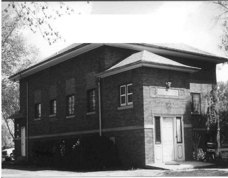
Figure 5: English Prairie School, near Spring Grove, Illinois, 1929

rural districts in McHenry County plus several more in neighboring Kane County combined with Huntley to form Huntley Consolidated School District #158 (Figure 4). 80